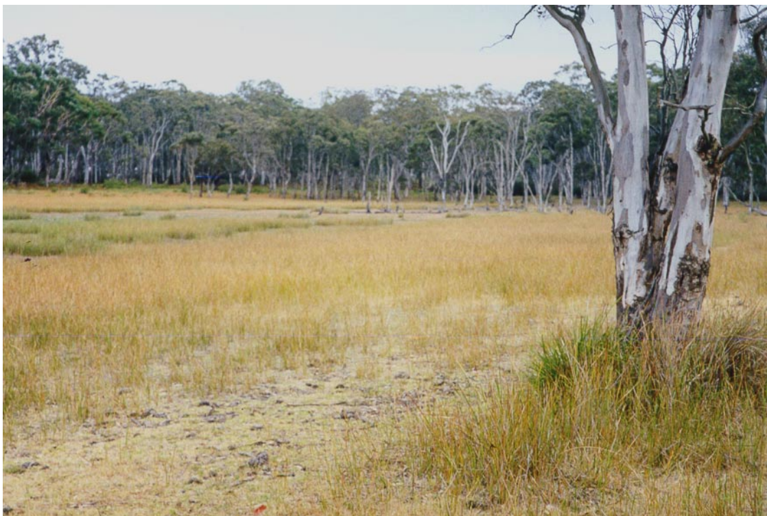
Sedge Wetland.