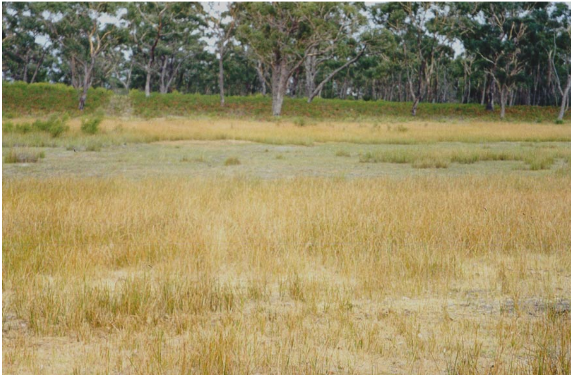
Sedge Wetland. Pithy Sword-sedge Lepidosperma longitudinale is dominate. Bengworden District.

A sedge-dominated wetland developed on deep peat. Sedge and rush species dominate, with various aquatic and semi-aquatic herbs also present.