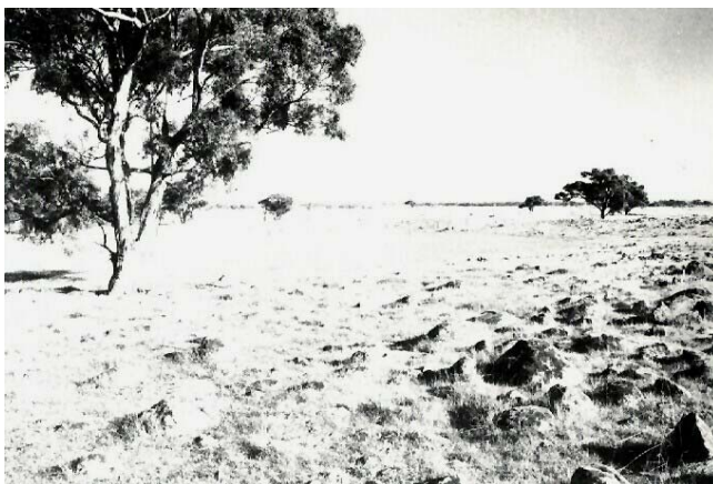
Basaltic plains near Woodstock, west of Bendigo