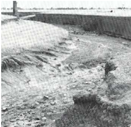
Severe streambank erosion occurs when flash flows from the adjacent bills flood into this land system.