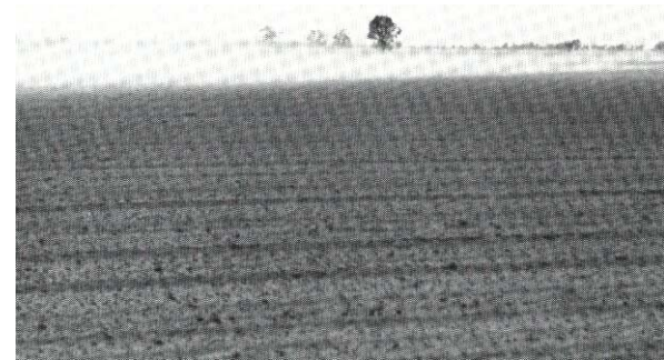
Bare fallows expose the weakly structured topsoil to the wind, making them more susceptible to wind erosion.