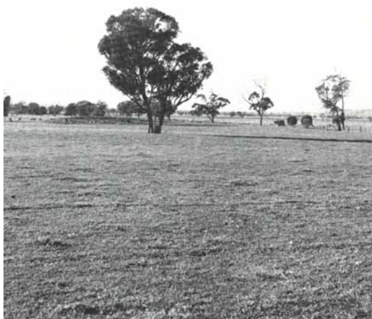
Extensive fertile plains are dotted with trees - grey box (Eucalyptus microcarpa) and buloke (casuarina luehmannii).

Waterlogging in isolated depressions and flooding along major watercourses are seasonal events of relatively low importance. The most significant forms of land deterioration include declining topsoil structure and soil nutrient levels, with consequent increases in soil compaction and run-off and reduced plant vigour. Actual soil loss through erosion is minimal.