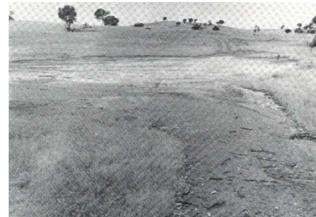
Shallow soils on the gentle crests (top) are highly susceptible to sheet erosion. Soil salting in the shallow drainage floors causes reduced vegetative growth, often emphasised by areas completely devoid of vegetation.