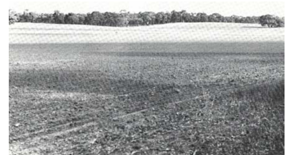
Grazing and cropping are the main forms of land use. Ridges of red iron-bark ( E. sideroxylon ) may be seen in the background.