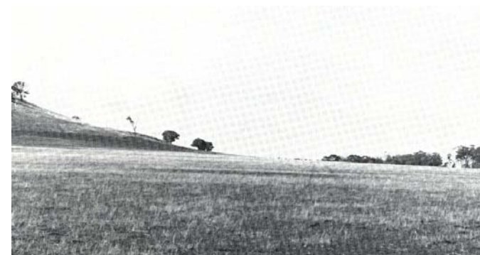
Cropping and grazing occur throughout this land system.