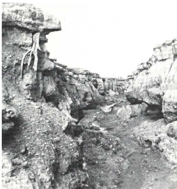
Hard-setting topsoils and dispersible subsoils result in severe gully erosion.