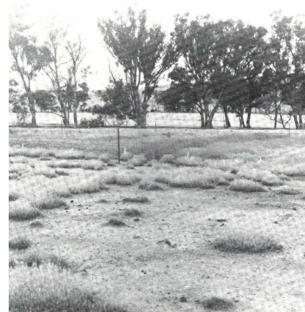
Not even the salt-tolerant sea-barley grass ( Hordeum hystrix ) can survive severely salted areas.