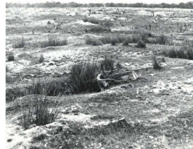
The uneven surface and scattered stony material of the gold-diggings degrade these areas to grazing land of low productivity.