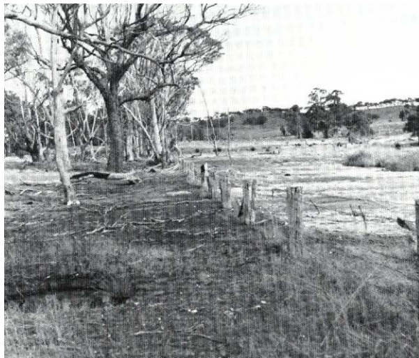
Salt-affected areas increase in size as the natural vegetation is killed off.