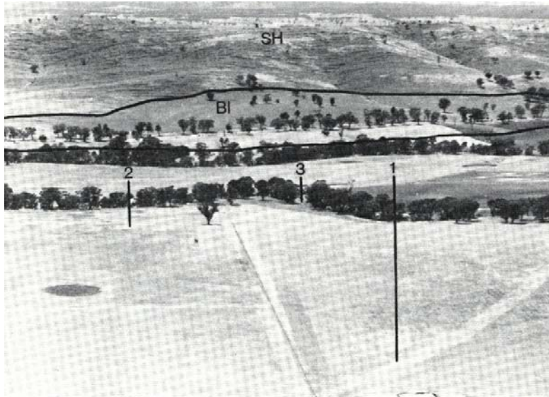
Broad flat plains are dissected by tree-lined watercourses.

The relatively narrow valley tract lacks the extensive areas of calcareous duplex soils characteristic of the Woosang land system to the north and the variety of soils found in the Natte Yallock land system to the south.