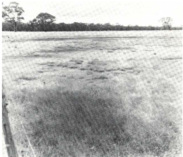
Pasture production is severely reduced where saline groundwaters rise to the surface.