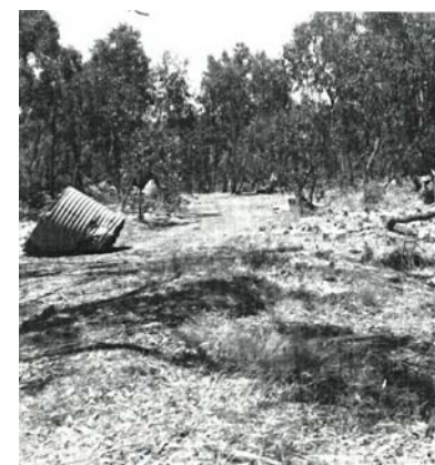
The rather straggly appearance of these gravelly areas deteriorates further when they are used as rubbish dumps.