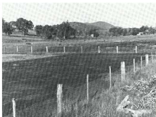
A rising saline water table, has caused soil salting, and subsequent low pasture production.