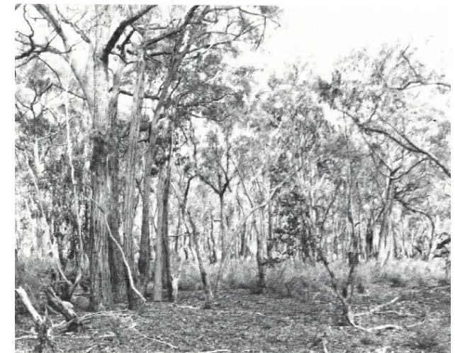
The heathy woodland has a characteristic straggly appearance.