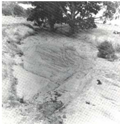
Sandy material - eroded from the undulating plain -chokes the watercourses and increases the potential flooding hazard.