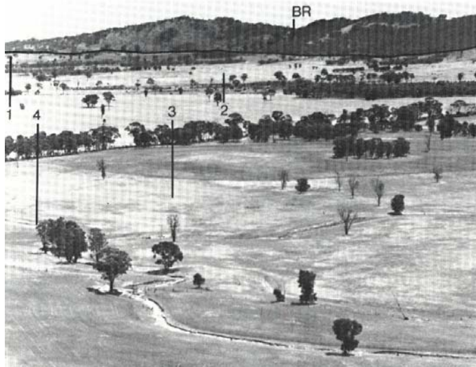
Most of the gentle landscape overlies a siliceous hardpan at 0.5 - 1.5 metres depth.