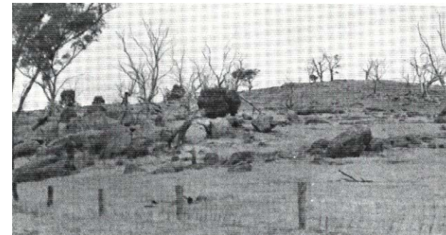
Overgrazing of the rocky outcrops increases overland flow and groundwater recharge.