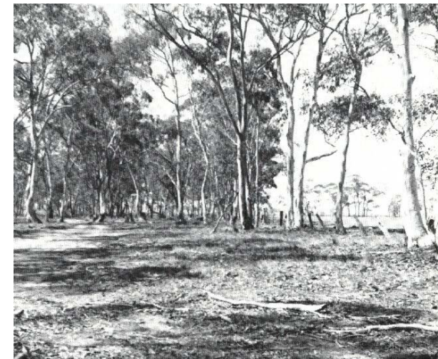
A small timber reserve retains some of the original woodland of grey box ( E. microcarpa ) and yellow gum ( E. leucoxylon ).