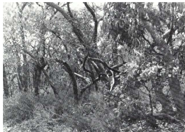
Heathy woodland, characteristic of the vegetation that grows on soils of very low nutrient status.