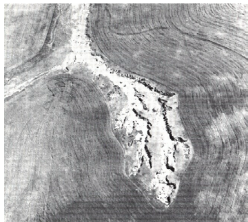
Active gully erosion removes soil, dissects farmland and lowers land capability.