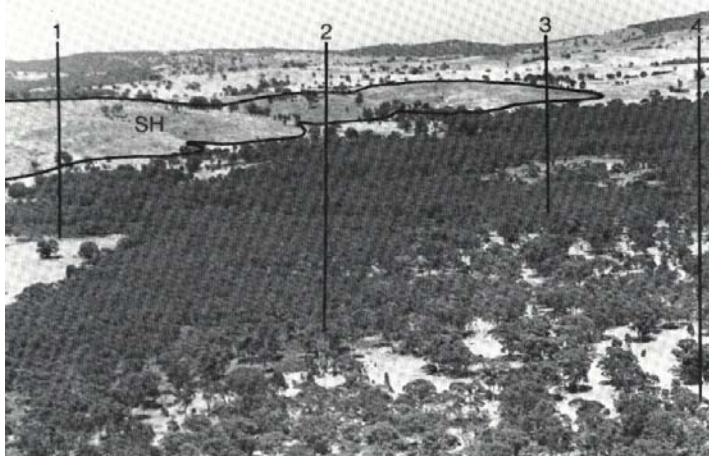
The low agricultural potential of this land system has allowed large areas to remain uncleared.