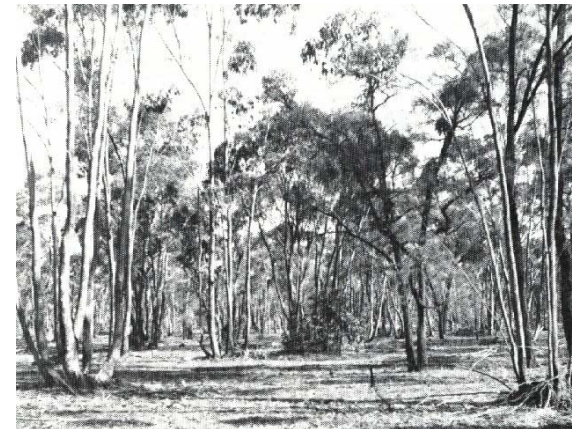
Woodland vegetation on the lower slopes not cleared for pastures is selectively logged for firewood and fence posts.