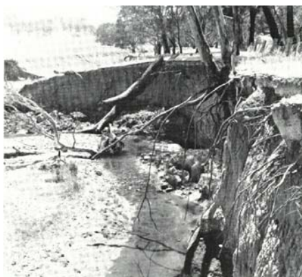
Increased flash flows undermine stream banks and threaten fences, roads and other services