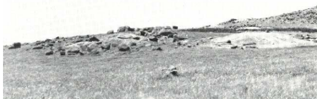
The droughty granitic soils are susceptible to sheet erosion should the native pastures be overgrazed