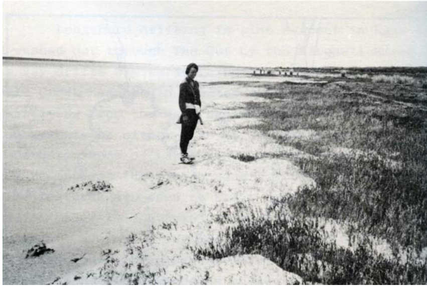
Plate 24 – Contraction ridge in course of formation at the outer edge of Salicornia marsh (cf. B in Plate 25) on the southern shore of Lake Reeve (J McKay)