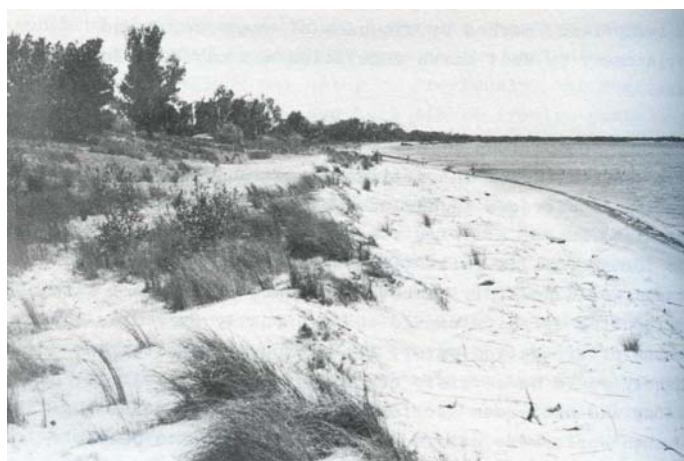
Plate 22 – Beach accretion, east shore of Lake Wellington (ECF Bird)

Emphasis has been given to the influence of ocean swell in shaping the outlines of the seaward margin of the coastal barriers. The Ninety Mile Beach has been shaped by patterns of refracted ocean swell, and the beach ridges and dunes on each of the barriers, running roughly parallel to the Ninety Mile Beach, commemorate the alignments of former shorelines. At the present time, ocean swell enters the lakes only in a very limited and much modified fashion, immediately inside the artificial entrance, where it has shaped the outlines of lake-shore beaches on Bullock Island (Figure 16), but with this exception the lake shores are the outcome of erosion and deposition influenced by patterns of waves and currents generated by wind action, and to a lesser extent by tides and river flow, within the Gippsland Lakes.