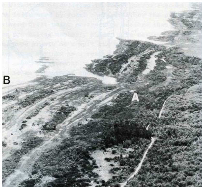
Plate 25 – Contraction ridges formed on the prograded (A → B) southern shore of Lake Reeve (N Rosengren)