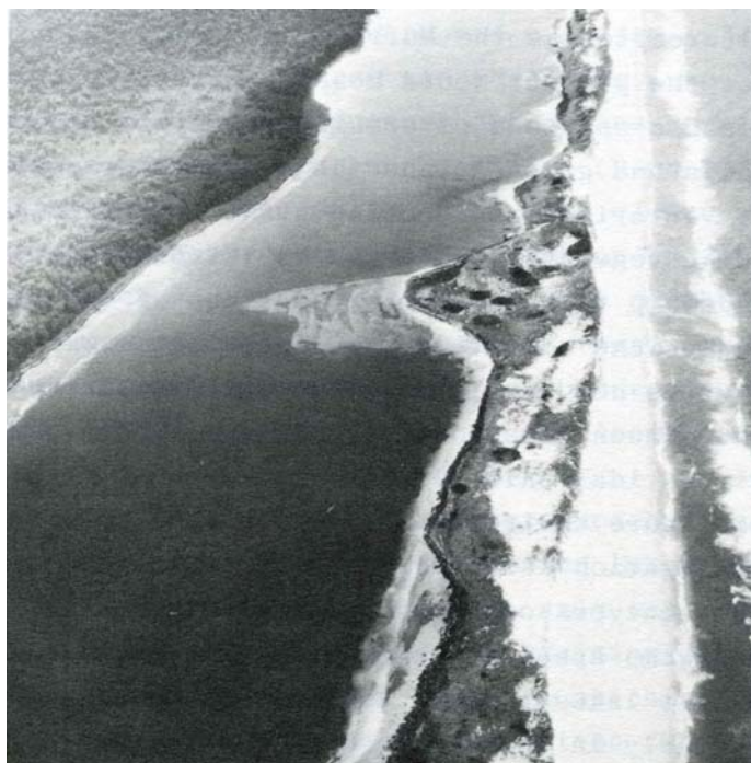
Plate 23 – Sandy depositional feature in Lake Bunga Formed where sand has been washed or blown over the outer barrier (N Rosengren)

Waddy Point. East from Waddy Point the drifting sediment includes pebbles as well as sand, the proportion of gravel increasing east of the eroding cliffs at Tannin Point, with accumulation in embayments such as Mason Bay. Cuspate forelands on the north shore of Lake Victoria (Storm Point, Waddy Point, Wattle Point, Point Turner on the Banksia Peninsula, and Point Scott on Raymond island) each show beach accretion on their eastern flanks, with beach ridges built up during periods of easterly wave action, and erosion on their western flanks, subject to the stronger waves generated by prevailing westerly winds: The points have thus migrated eastward in recent years.