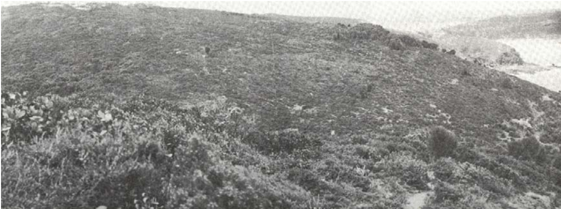
These rugged coastal cliffs provide some of the most spectacular coastal scenery in the study area.

Clearing is confined to an area near Apollo Bay used for grazing. The area has high landscape and nature conservation values, but disused sand and gravel extraction pits at Moonlight Head and Rotten Point detract from these attributes. Once the vegetation is disturbed, re-establishment is slow and difficult and sheet, rill and gully erosion are likely to occur.