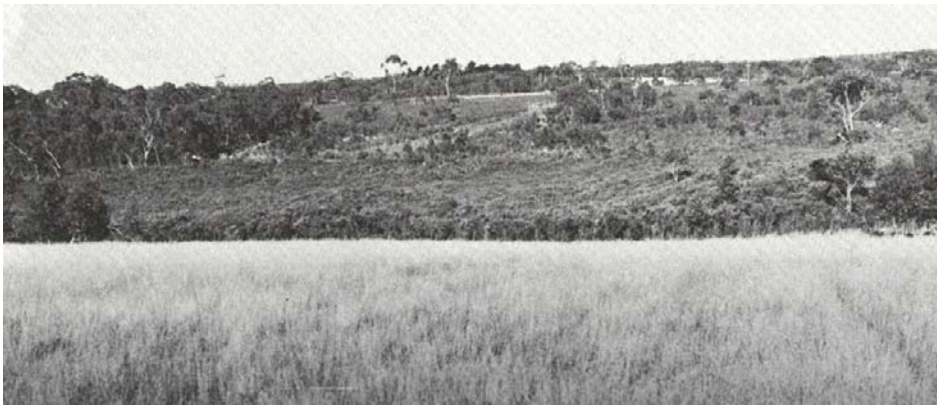
Drainage of these landscapes is poor, and the waterlogged soils carry woodlands of E. nitida and E. radiata with closed scrubs in the drainage lines.

Clearing of these areas for agriculture has been attempted in many areas, but impeded drained on sites with hardpans and excessive drainage on sites without them create management difficulties. Deep ripping of the hardpans may improve site drainage, but low soil pH and low fertility also have to be contended with for successful pasture establishment. Most areas remain as wildlife habitats, with the exception of one near Princetown and part of the area near Tomahawk Creek, which border the Heytesbury Settlement Scheme.